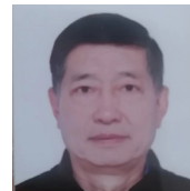
Professor of International Law and International Relations at the Shi Liang School of Law, Changzhou University

In his latest book " Leadership - Six Studies in World Strategy ," Dr. Henry Kissinger has expounded his views on statecraft. He writes that any society, whatever its political system, is perpetually in transit between a past memory and a future vision since both are the inspiring forces of evolution. "Along this route, therefore, leadership is always indispensable." 1